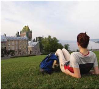
Quebec City, Canada