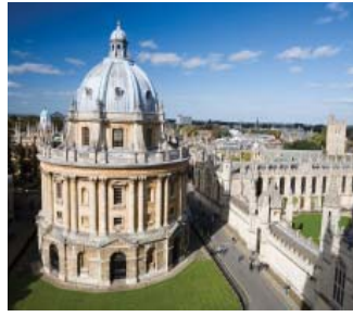
Oxford University, England